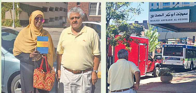
Masjed Abubakr Al-Seddig Mosque in Rochester, Minnesota