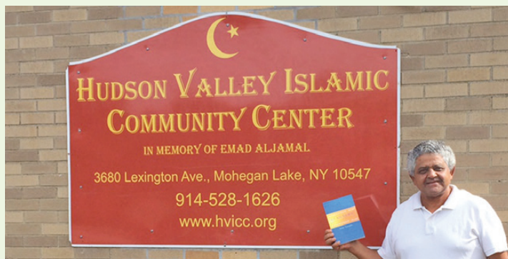
Hudson Valley Islamic Community Center, Mohegan Lake, New York