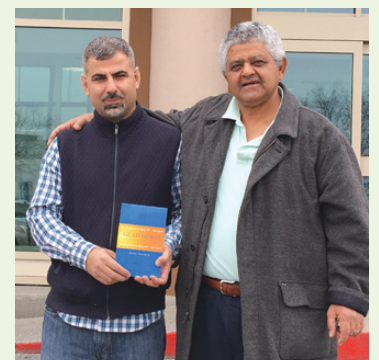
Islamic Center of Nashville, Tennessee