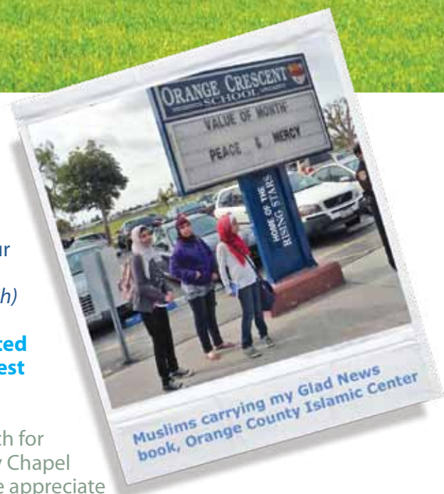
Muslims carrying my Glad News book, Orange County Islamic Center

And He Himself gave some to be...teachers for the equipping of the saints for the work of ministry, for the edifying of the body of Christ. – Ephesians 4:11–12